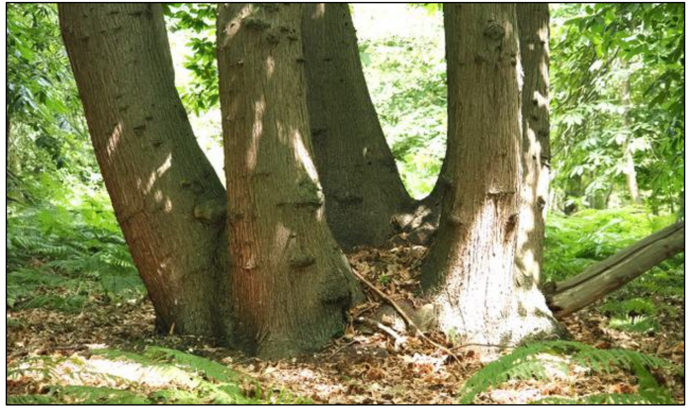
Old Sweet Chestnut Coppice