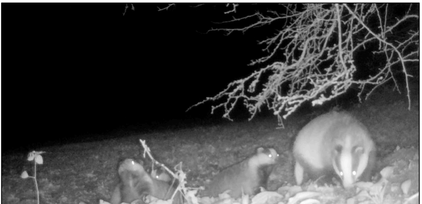
Badger and 3 cubs recorded on infrared video camera in Bentley